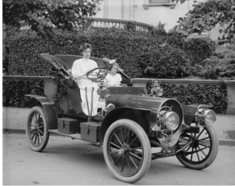
Figure 1: 1907 Franklin Model D roadster. Photograph by Harris & Ewing, Inc. [Public domain], via Wikimedia Commons. ( https://goo.gl/VLCRBB )