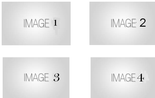
Figure 3: The layout of multipart images should be as per the above example within the table. All images must have the “Image” style applied.